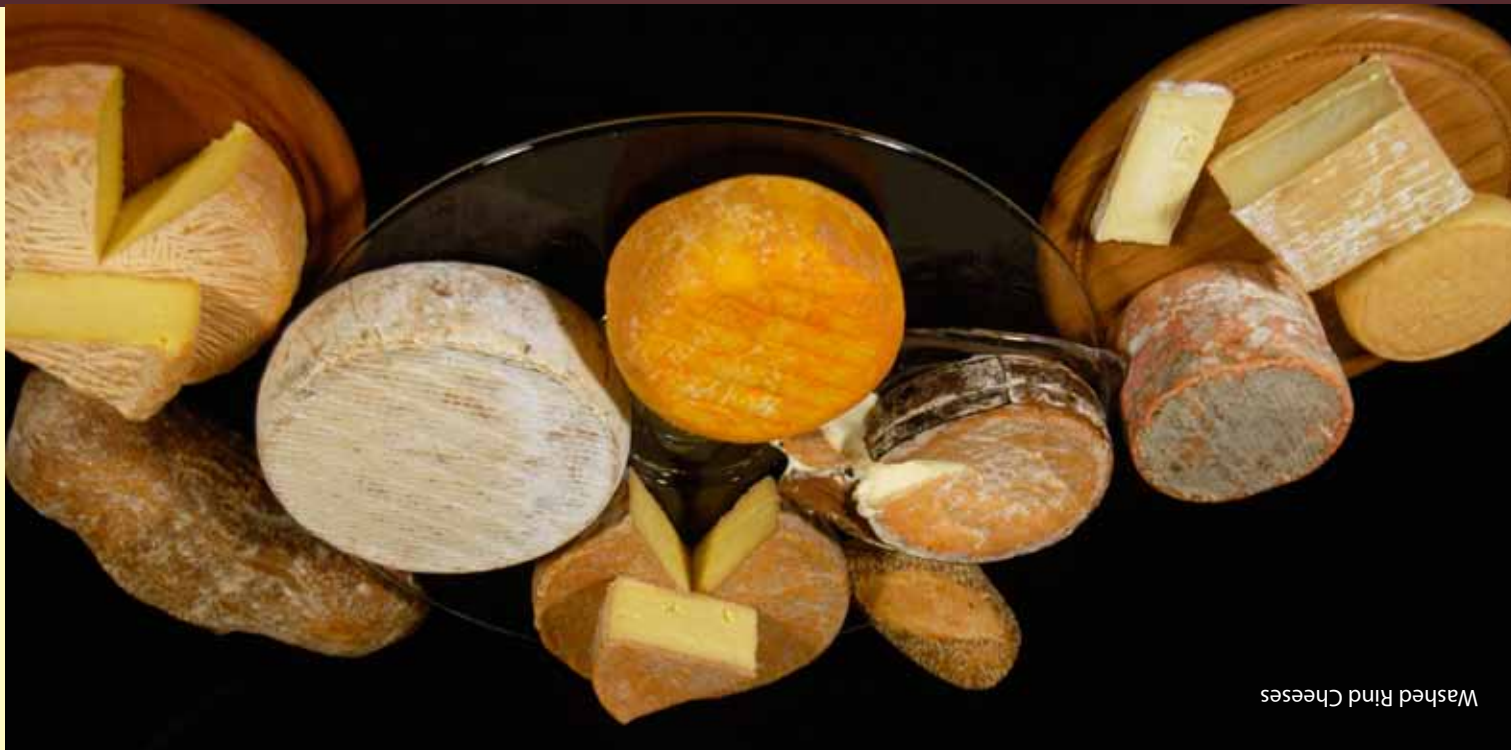
Washed Rind Cheeses